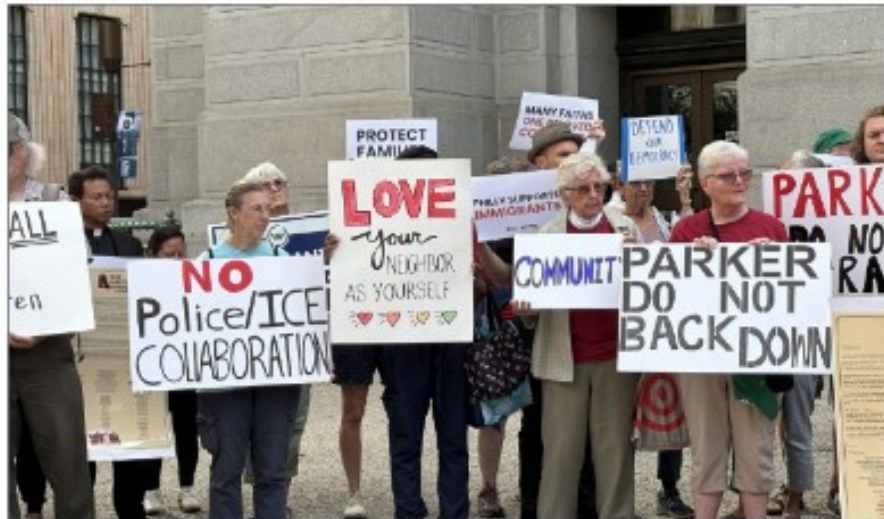
Supporters of the New Sanctuary Movement rally outside City Hall to urge Mayor Cherelle Parker to stand up to Trump on sanctuary cities.