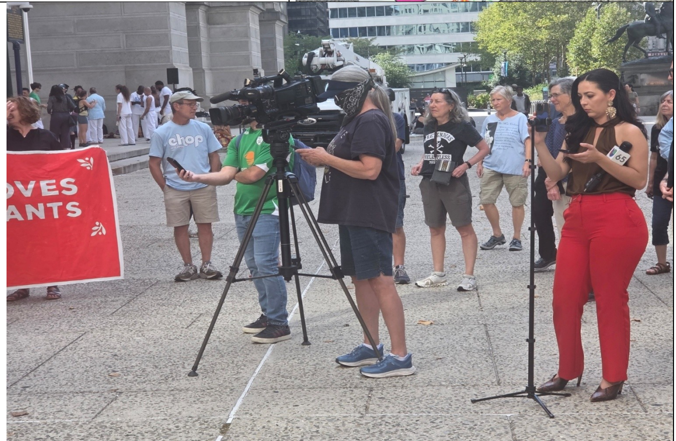
I wonder why the camera person decided to cover her face. The event made it to the evening news and both local Philadelphia newspapers the next day (9/5/2025)