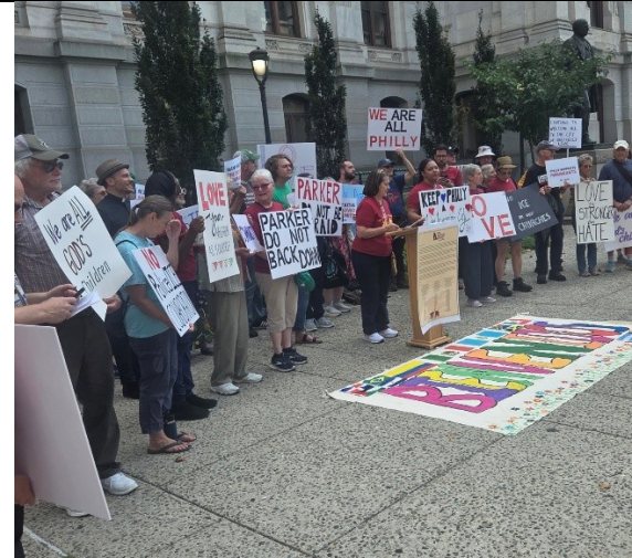
Good multi-faith gathering including a time of anointing with oil in pairs.